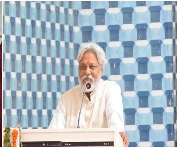
Address by Shri Rajendra Singh Ji, Waterman of India and Ramon Magsaysay Awardee, Chief Guest