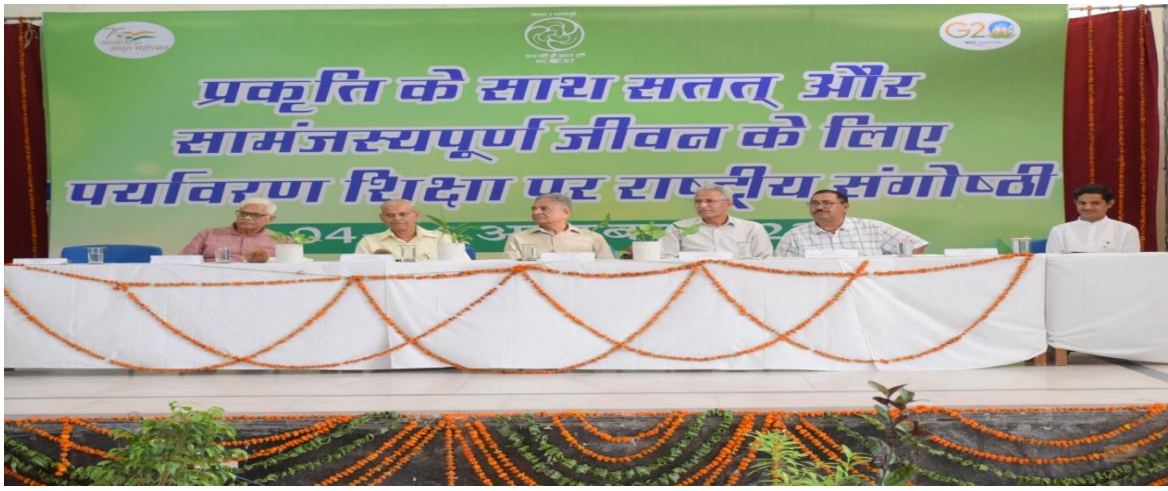
Valedictory function of the Seminar