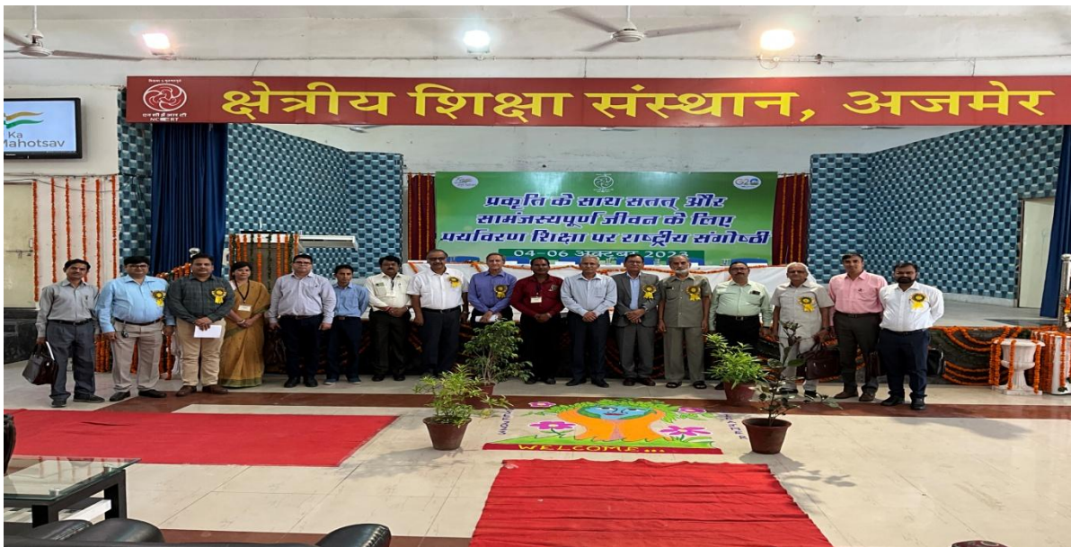
Group Photo with Chief Guest and Keynote Speakers