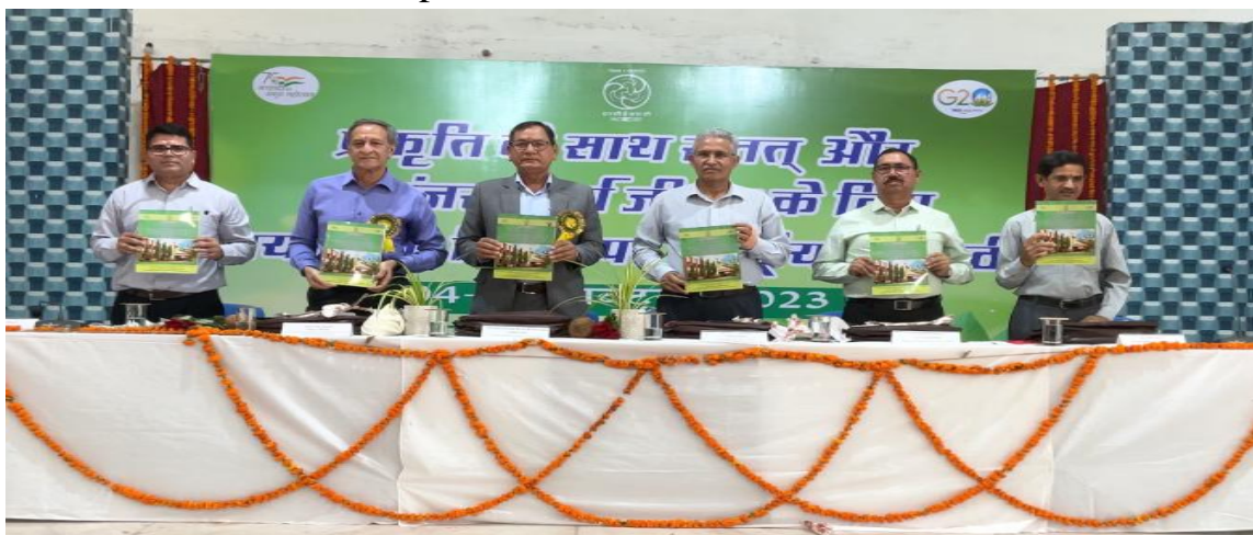
Release of the Souvenir of the Seminar by the Chief Guest