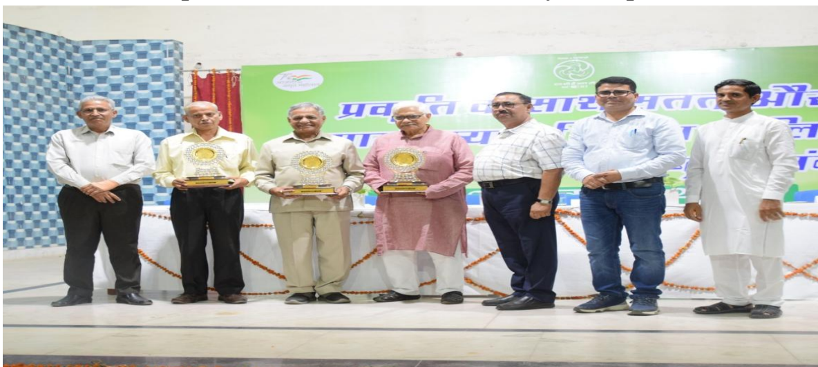
Felicitation of Chief Guest and Guest of Honour by Chairperson